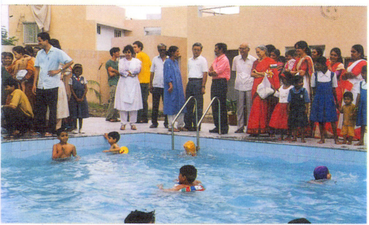
Children enjoying in the pool