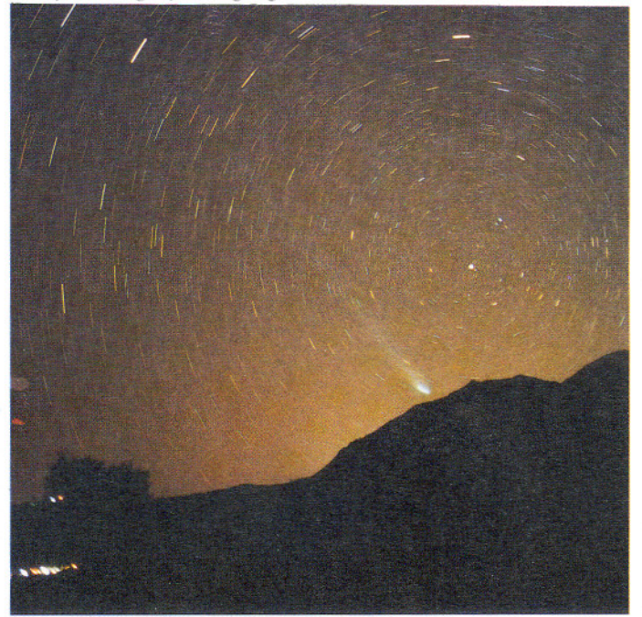
Comet Hyakutake : This photograph of comet Hyakutake was taken by Suhas Gurjar, on March 27, 1996. He used Kodak Gold film - 400 ASA. He used 28 mm lens at f/2. Notice the curved star trails and long tail of the comet.

Lastly, some tips: Keep the aperture of the lens one stop less than full open. Avoid taking photographs during a moonlit night, it will fog your film, and if you must, then give shorter exposure, and Always take two extra exposures slightly longer and slightly shorter than what you thought you might give.