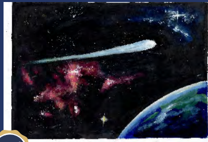
Shloka Ganesh Shetty