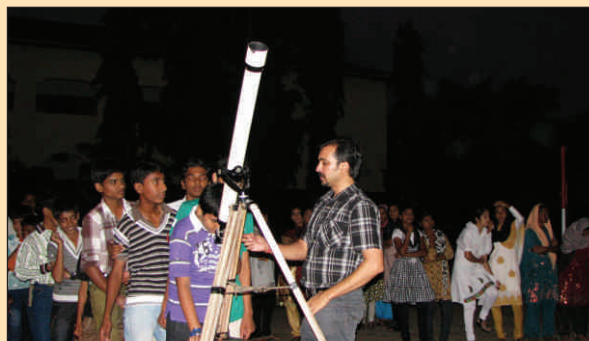
Students at IUCAA's celebration of the International Observe the Moon Night - 22nd Sept. 2012.

More than 6000 students, in places as far as Sangamner, in Ahmednagar District of Maharashtra, have been exposed to the wonders of the night sky through Mobile Planetarium Programmes of IUCAA astronomy outreach. From July 2012, over 200 shows have been very successfully run by many enthusiastic school teachers and volunteers trained at IUCAA.